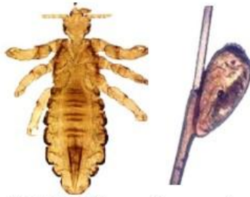
Head lice are 2 - 4 mm long.